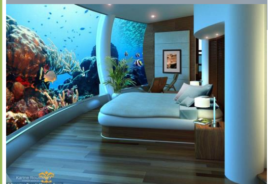
Poseidon Undersea Resorts, Fiji