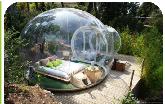
Bubble Hotel Attrap' Rêves, France